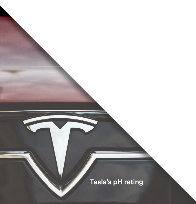
Tesla's pH rating

High search volume, and high brand exposure. Became a household name within a few years.